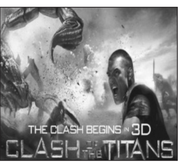
3-D MOVIES ARE ALL THE RAGE TODAY picture is another very

Clash of the Titans is doing well in the box office, claiming $61.4 million on the opening weekend. It has since made over $110 million in total revenue; pretty well for another fantasy, action movie. This film has good scenes and grasps audience's attention but at times viewers could daze off. Several scenes are fair-